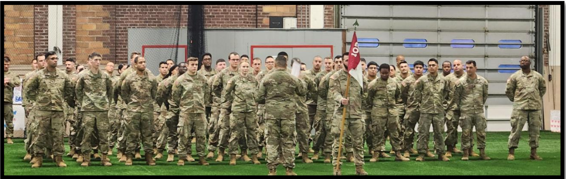
HHT 102 FORMATION