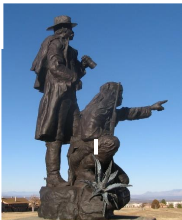
“ The Eyes of The Army ” Depicted is a kneeling Indian Scout reconnoitering with a United States Cavalry Officer of the Nineteenth Century. These native scouts played a vital role in campaigns such as the hunt for Geronimo and others. The Scouts were active until 1947 when their last member retired from the Army. The statue is on the Heritage Trail of The Military Intelligence Museum, in the vicinity of the Buffalo Soldier Trail, Fort Huachuca Arizona.