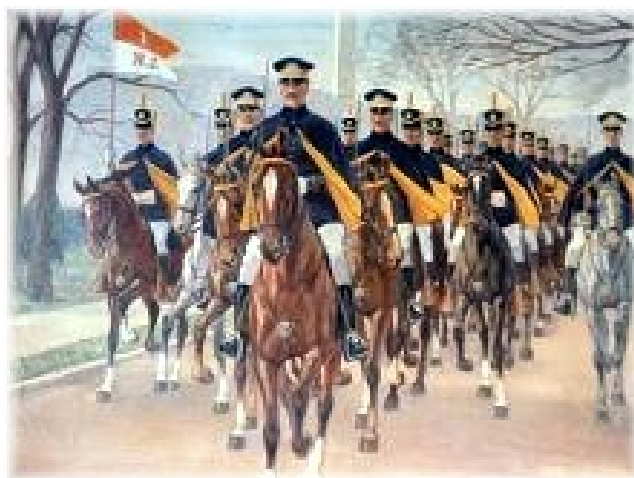
1 ST New Jersey Cavalry

MISSION STATEMENT: It is the continuing objective of The SPUR to foster and preserve the Spirit of the 117 th Cavalry Association, and to promote and enhance the friendships and camaraderie of our members, who are mutually bound by service and devotion to our country. NEXT ASSOCIATION MEETINGS - Fridays 1930 hours: February 13, 2015; April 10, 2015; June 12, 2015; September 11, 2015; November 13, 2015.