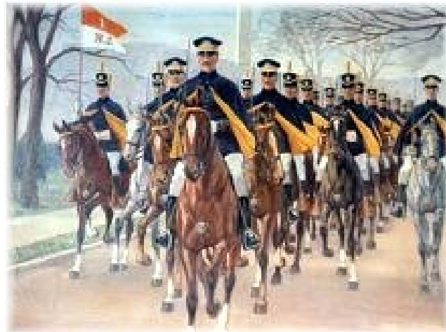
1 ST New Jersey Cavalry

MISSION STATEMENT: It is the continuing objective of The SPUR to foster and preserve the Spirit of the 117 th Cavalry Association, and to promote and enhance the friendships and camaraderie of our members, who are mutually bound by service and devotion to our country. NEXT ASSOCIATION MEETINGS - Fridays 1930 hours: April 10, 2015; June 12, 2015; September 11, 2015; November 13, 2015.