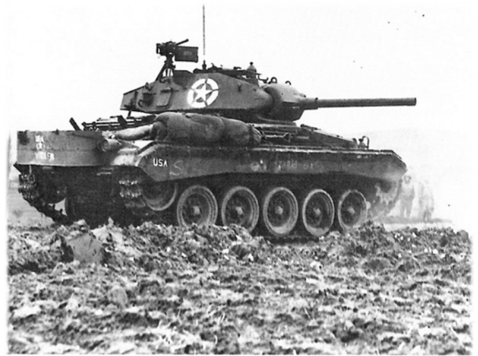
An M24 of the 117th Cavalry Recon Squadron test fires its gun in the St. Jean Saverne area of France, March 1945. The circled turret star is rare for an ETO vehicle.

Cavalry tankers trained in the M3 "Stuart", and fought her in North Africa. The M5A1 Stuart shown above replaced the M3. Roomier and powered by twin Cadillac engines, it was still obsolete and under gunned, using a 37 MM canon. F Company tankers of the 117 th CRS and 102d Cavalry Group made the best of it...developing outstanding accuracy, placing good shots in vital places. In February and March 1945, all M5s were replaced by the new M24 "Chaffee" light tank. Powered by twin Cadillacs, she had torsion bar suspension and a new 75 MM cannon. Better mobility, much better main gun effectiveness, but still inferior to German Panzer IV, Panthers and Tigers. Nevertheless, the seasoned tankers LOVED her! She was sure pretty!